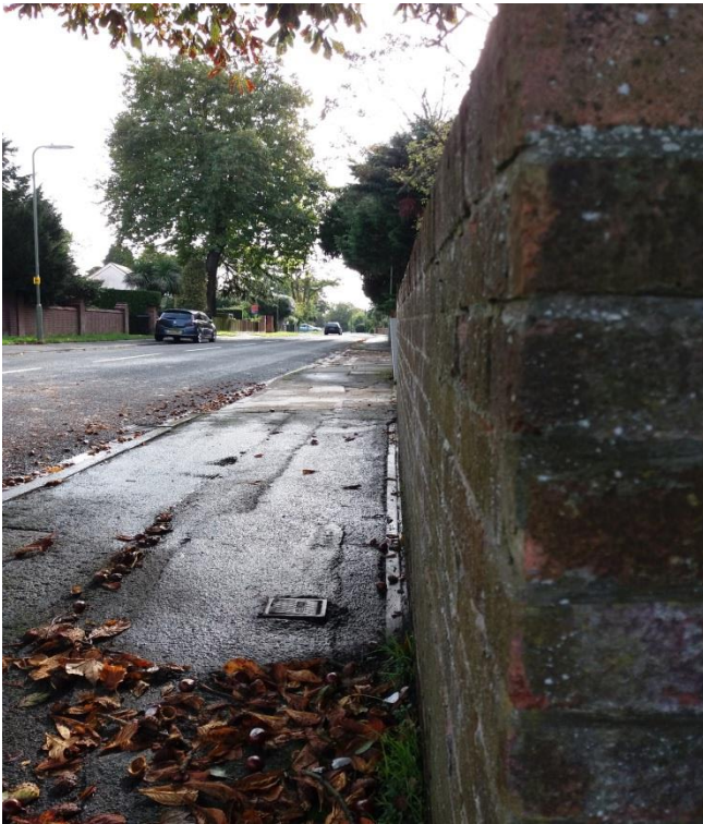
View adjacent to wall looking east