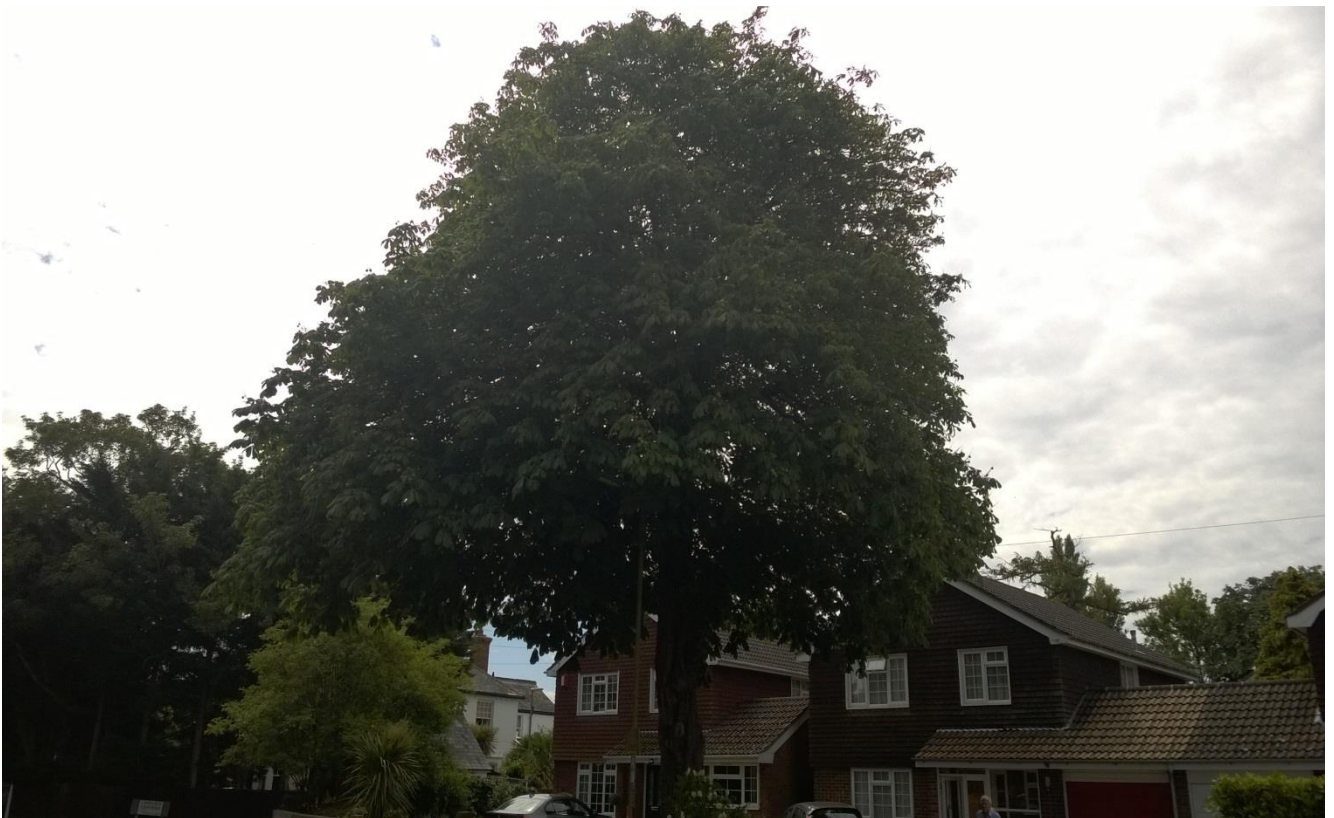
September 2017 – from north