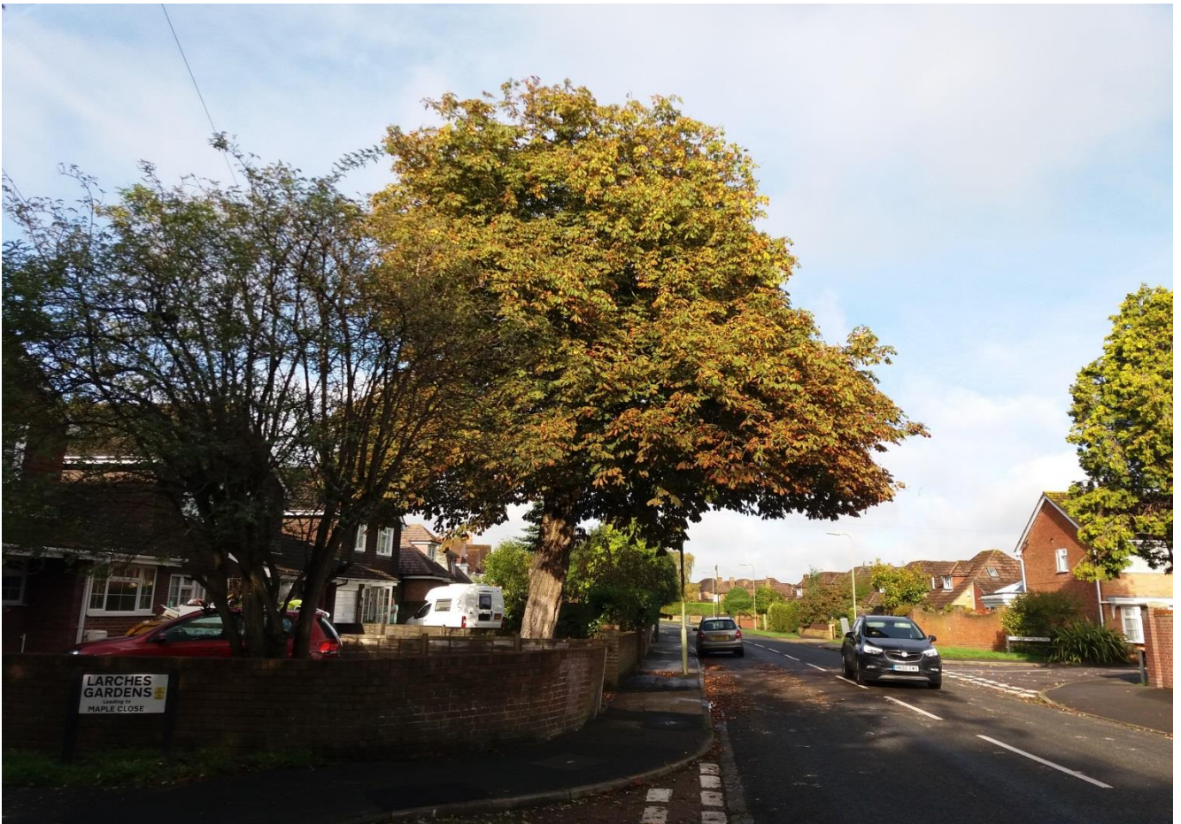
July 2015 – from north