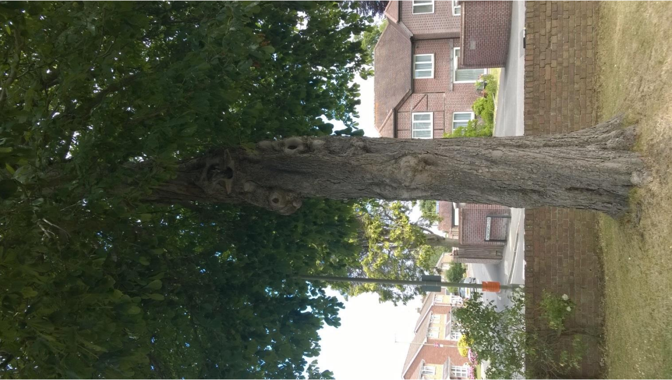
September 2017 - from south west